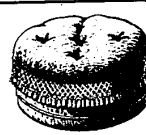
42" round ottoman