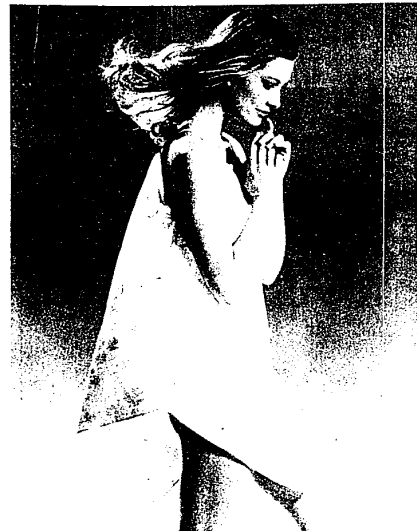
The Pagliai float can be teamed with pants, drift lightly over a bikini, or it could be all that's needed for a summer's night slumber.

Hudson's-Stroh's Fireworks Extravaganza — The 20th annual fireworks display will begin at 9:35 p.m. with a half-million viewers expected to watch from both banks of the Detroit River. Four barges will be moored halfway between the United States and Canada from which the dazzling display will be detonated. In the event of rain the display will be held on July 1.