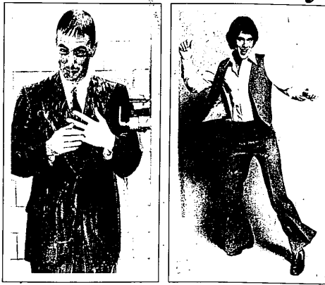
Dacron went the way of the wet look when it was introduced 25 years ago (left). At the right, it's shown in brand new separates including slacks and vest by Angel Flight and a silky fly-front shirt from Manhattan.