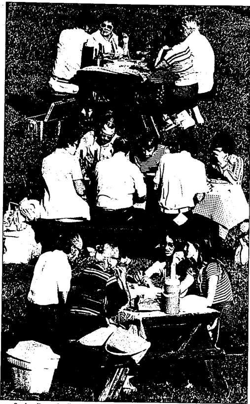
Sunday dinner, family-style, precedes concert at Meadow Brook Music Festival in Rochester.