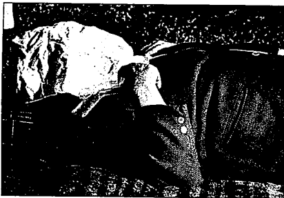
A handkerchief makes a handy sun shield when you want a snooze before the concert.

The Meadow Brook experience begins, usually, with a picnic on the lawn.