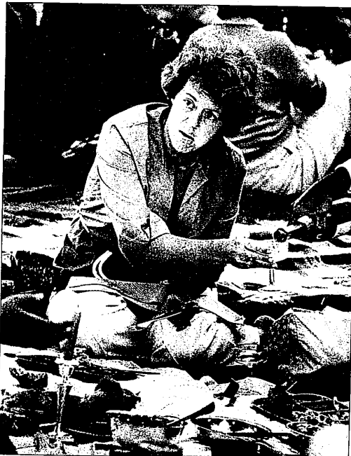
Who says you can't get away from it all—and take it with you—at the same time?