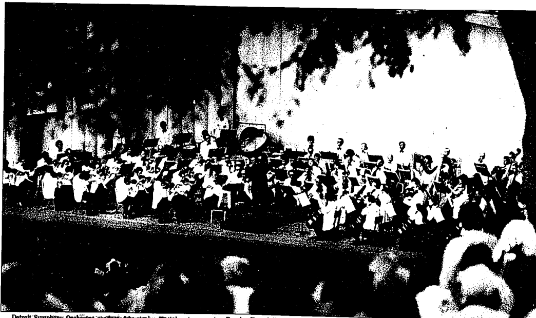
Detroit Symphony Orchestra conducted by Andre Kostelanetz presents a Russian-French Pops Evening at Sunday's concert in Baldwin Pavilion on the Oakland University campus.