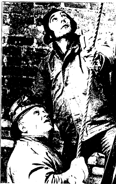
Workmen keep close tabs on the progress of the bell's ascent to the tower.

This summer, the bells of Christ Church will have a purer tone and a richer sound.