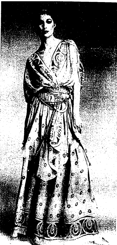
Dress in a Mary McFadden design and you may find you like one like this hand painted silk. The silhouette is wide across the shoulder, yet soft, and belted and wrapped below the waist. The designer likes gold in rope belts like this one, a motif repeated in the model's hair. A trunk showing of her wares will be at Hattie in Birmingham Thursday, Friday and Saturday.

tion, all intermingle and mesh for an elegant and functional purity.