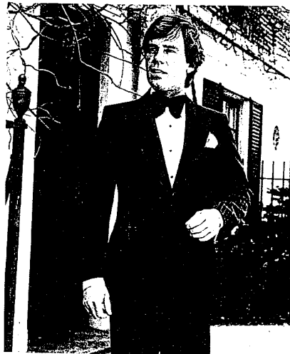
The brown chalk stripe dinner jacket is cotton velvet, a design by Lord West. The elegant outfit for a formal night on the town has brown grosgrain peaked lapels and piped besom pockets. The satin striped dark brown trousers are blended in Dacron and wool.