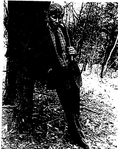
Country elegance is seen in this outfit by Harold Tillman. The brown, tan and grey tweed double-breasted jacket has narrow lapels, four buttons with only one button to close. The chocolate brown corduroy slacks are double pleated and cut with straight legs and side seam pockets.

Wool will be a favorite fabric either in challis, tweeds or knits. There are both country and dressy looks and among the most popular patterns will be stripes, plaids, checks and tweed effects. Knits will be very important, especially the skinny knit. Paisleys, regimental stripes and neat foulards will be dominant among the patterns in silks.