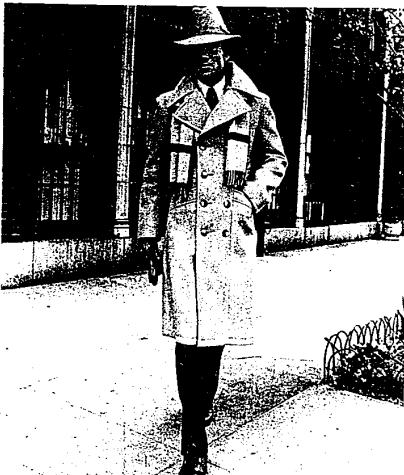
This camel double-breasted top coat by Taylor Sportswear has a panel front, front and back yokes and vertical deep tucks in the front and back. Blended of Collins & Alkman polyester plush imitation wool, the coat has a removable sash tie belt and slash pockets with a welt top.