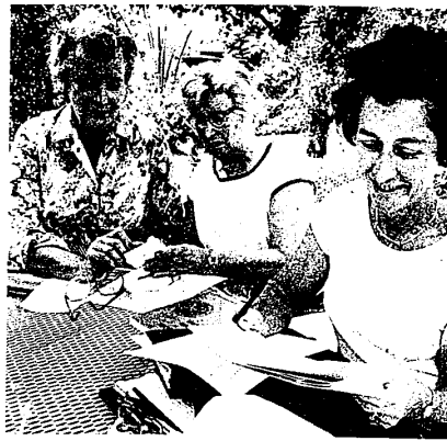
'From Adam's Rib - -'