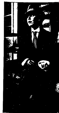
For the trip from office to country Calvin Klein's pea jacket, Ralph Lauren's wool skirt, and Klein's pinstripe shirt, are essential investments available at Lord & Taylor.