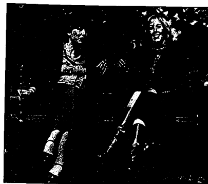
Anne Klein's mohair and wool sweater and skirt with Western detailing, are from Lord & Taylor. Cesarani's corduroy suit is really paired separates, jacket and skirt at Bonwit Teller.