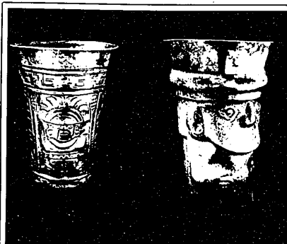
Benker on the left depicts three standing figures holding staffs. Each wears a feather headdress and decorated skirt. The one on the right is embossed with a face and torso. They are thought to have held chicha, a maize beer used during religious and political ceremonies.