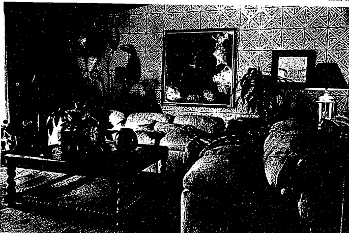
A pink abstract painting over the sectional gives a vibrant quality to the living room.

The play of colors and textures, the original art with its touches of brilliance, the carefully planned lighting, all go together to make this nighttime house a delightful retreat that could be in the middle of a big city, in the north woods or in a pleasant subdivision—for instance, in Troy.