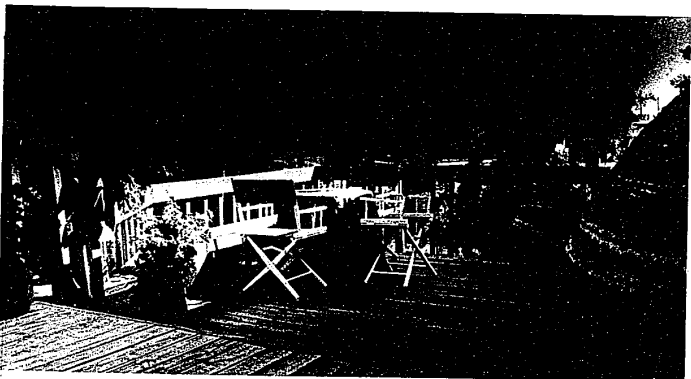
The two-level deck off the dining room became a "summer resort."