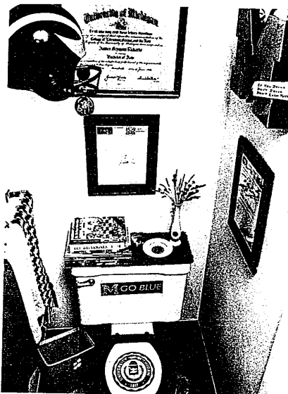
Smallest room in the house carries a decided identity.