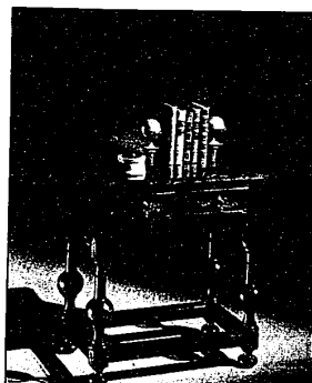
shown: nighttable from Baker 17th Century English collection

Words can only do so much. One visit to our store will show you what we mean by The Decorative Interiors touch. Please stop in to browse. It's an experience we think you'll enjoy.