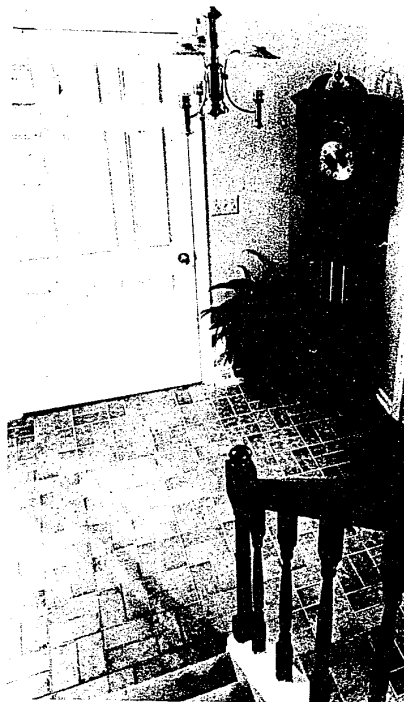
Modern doors are designed for a clean, distinctive American look.

clean-lined, distinctively American look. For example, the three-panel door, with large deeply grooved panels set vertically down the center suits modern room settings—glass, brass, and light-toned furniture. To heighten the visual effect, all door styles can be obtained as double-entries—duplicate units set side by side in a wide opening. Wood panel interior doors, as well as entrance doors, come in stock sizes at local lumber dealers, home centers and building supply stores. House entrances are available as preassembled packages that include a wood panel door and appropriate decorative features such as columns, sidelights, side panels, pediments, fanlights, and cathedral lights.