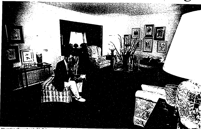
It's spring all year long in this living room done in shades of yellow.