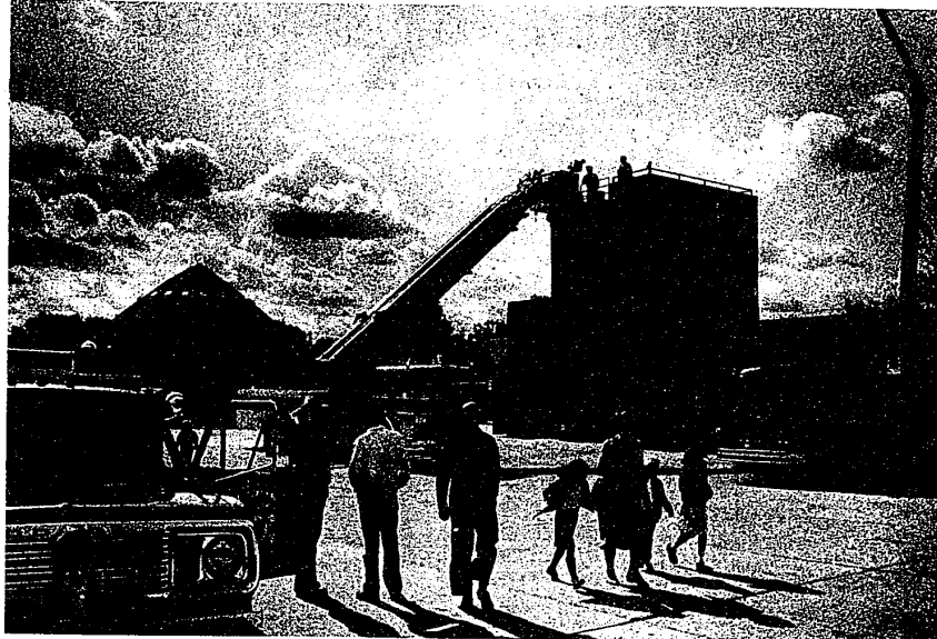
Displaying their wares

City of Farmington firefighters display part of their equipment during last week's firefighters week.