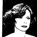
Perm & Color High Lighting

We look forward to serving you in a uniquely different salon with individual rooms for the privacy necessary for helping you find the hair design correct for you, based on your bone structure, weight, and height. Consultation, shampoo, haircut, air forming and curling iron complete...$15.50.