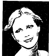
Air Forming, Curling Iron & Color Highlighting