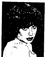
Perm & Precision Cutting Dried Naturally