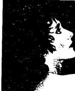
Combination Perm & Natural Lamp Drying

7 Mile and Farmington Center (above McDewitt's)