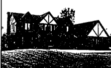
PALATIAL TUDOR on beautifully groomed 2.8 acres in Birmingham area. Long circle drive, hotel-size foyer, grand formal dining room, massive island kitchen, Central Air, etc. 626-9100. $250,000.