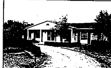
PRESTIGE Bloomfield on the Lake. Prize Executive Ranch. Beautifully groomed grounds, long circle drive. Big wood parquet foyer, great family room with brick wall fireplace. TOPS! 626-9100. $134,900.