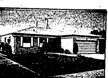
LIVE IN TROY. All brick Ranch offers 3 bedrooms, 1½ baths, family room with fireplace, kitchen with built-ins, big flagstone patio, gas grill, fenced yard. Garage opens. Walk to schools. 689-8900. $60,900.