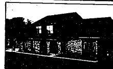
AMAZING Contemporary , West Bloomfield; Newer home. Soaring 2-level ceiling in big living room with balcony accented by excellent wallpaper, draperies, luxury carpeting. A must see! 557-6700. $169,900.