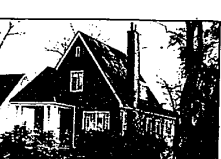
ENGLISH COTTAGE appeal, conveniently in-town Birmingham. Extensively updated home has 3 bedrooms, 1½ baths, fireplace, large dining room. Immaculate, immediate possession, just listed. 646-6000. $74,500.