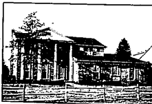
ROCHESTER at its best! Spacious 1977 home. Large family room with fireplace, library with wet bar, 4 big bedrooms, wood deck. Professionally decorated. In exclusive new area. 651-8850. $159,900.