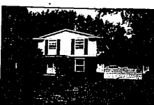
PRIVACY on heavily treed lot, Franklin Corners. Immaculate, beautifully decorated home. Full brick wall fireplace in family room, laundry off kitchen with pantry. Gorgeous yard. 626-9100. $123,900.