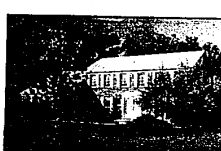
STATELY elegance . Masterpiece home, lovely setting. White marble foyer, rustic fireplace family room, library plus 4 huge bedrooms. 3½ baths, garden kitchen, Central Air. House Beautiful! 647-5100. $129,500.