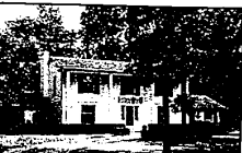
TREES and privacy , Bloomfield Hills estate. Be proud owners of this majestic home. Spacious, quiet elegance in neutral decor. Sweeping circle drive, large slate foyer. Lake Privileges. 626-9100. $169,900.