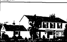
EXCELLENCE! Custom West Bloomfield home. 4 king-size bedrooms, rustic fireplace in family room, super-super rec room plus crown moldings, extra insulation, extensive built-ins. 626-9100. $129,900.