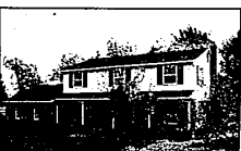
COUNTRY LIVING on near acre, Birmingham area. Circle drive, beautiful yard. 4 huge bedrooms, fireplace family room, first floor laundry, large kitchen and nook. Immediate Possession. 851-8100. $126,900.