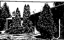
ATMOSPHERE , an adventure in space! 23 acre with sprawling Ranch home. Chef's kitchen with built-in refrigerator, imported panelling in family room, spacious bedrooms, 2 full baths. 557-6700. $84,900.