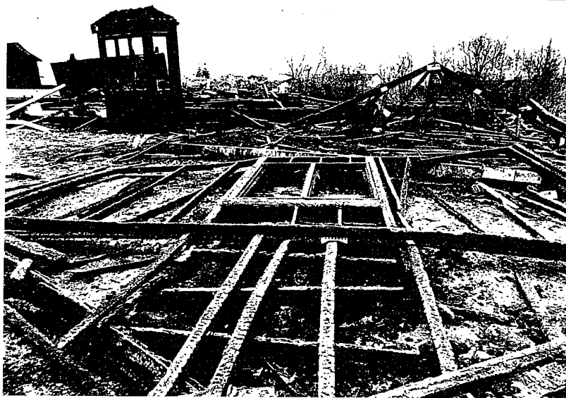
Two neighborhood youths destroyed the dreams of Dennis Myra Potocsky when the pair allegedly poured gasoline on the Potocskys' new garage and house under construction in West Bloomfield.