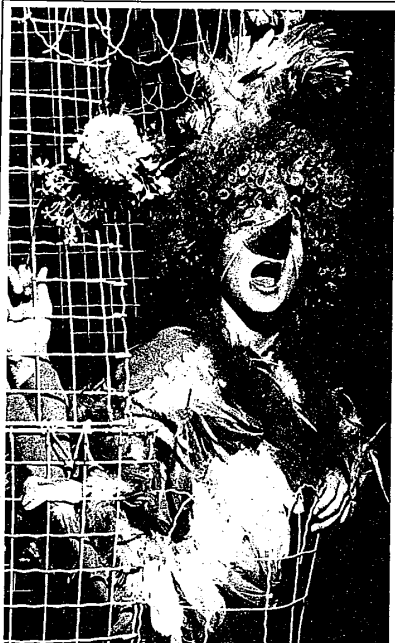
An actor rehearses for the children's musical, "Scat." Costumed actors will perform some of the play's songs at a Bloomfield Hills School District presentation Dec. 4.

800-228-9000 Gets You Hyatt Worldwide and Toll Free