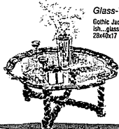
Glass-Top Cocktail Table

Gothic Jacobean "twisted rope" legs in fruitwood finish. Glass top rimmed with heavy scalloped brass. 28x48x17 h. $649