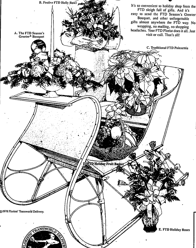
B. Festive FTD Holly Bowl

He delivers living, loving gifts for you.