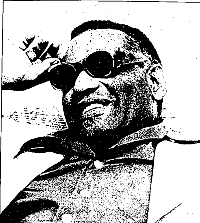
Ray Charles with the Raeletts and the Ray Charles Orchestra will appear at the Music Hall.

The "King of Soul," Ray Charles, will sing his greatest hits at Detroit's Music Hall. Backed by the Raeletts and the Ray Charles Orchestra, Ray Charles' revue opens Dec. 28 and will wrap up with a special New Year's Eve show.