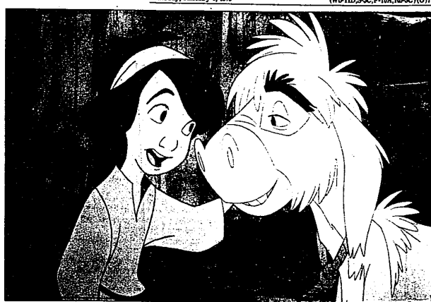
Young boy offers kind words to his donkey after learning the animal must be sold, in "The Small One."