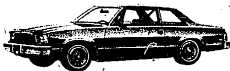
1979 MALIBU'S 2 doors & 4 doors