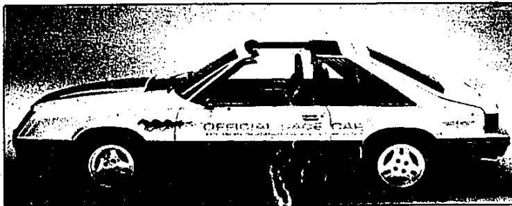
The 1979 Indianapolis 500 pace car.