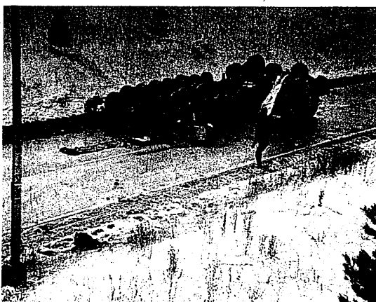
A police officer takes a measurement at the scene of the overturned steel hauler.