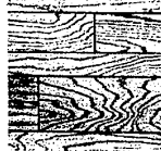
Villa Nova Plank HB