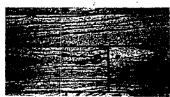
Village Plank OEMB