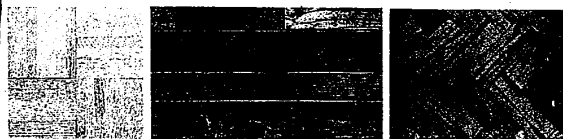
Cumberland II® Oak Parquet CB