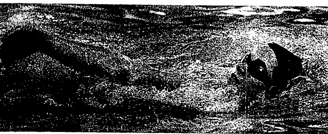
After a first place finish in the 100-yard fly, North's Kirk Knock churns to a second in the 100-yard back.

Farmington was out of the running by the end of the first quarter, trailing 25-9. Northern lengthened its lead to 49-20 at the half and continued to stretch it in the final two periods.