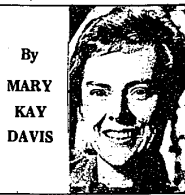
By MARY KAY DAVIS

If your house is as pale as your window color, (mine was light yellow), outline any unshuttered window edges with Back Stitch over two threads, using single strand of trim colored wool. All windows are diagrammed in this manner.