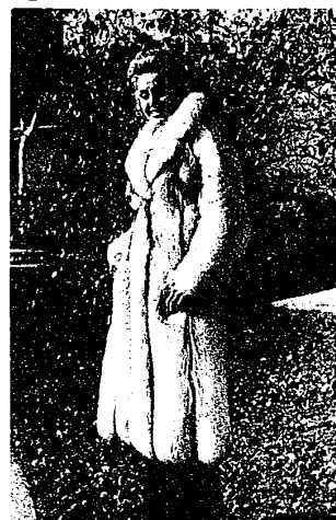
Full-length Fox coats from $2500