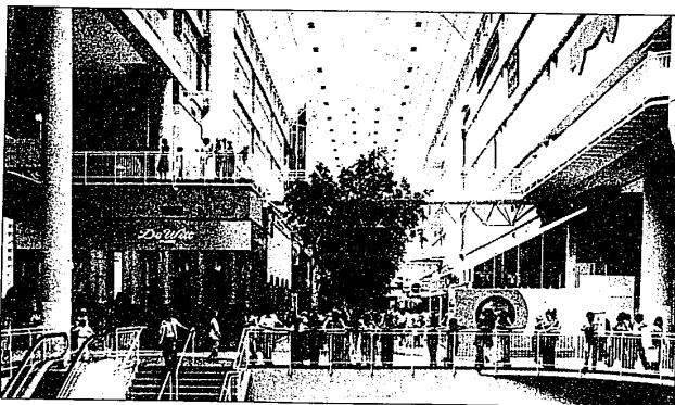
Galleria dramatizes Toronto's Eaton Centre.