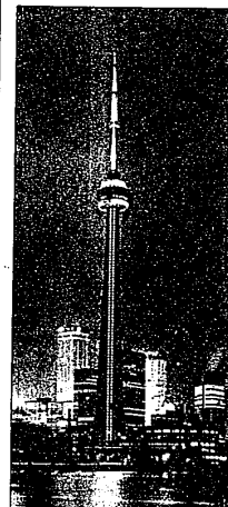
CN Tower is spectacular by day or night.