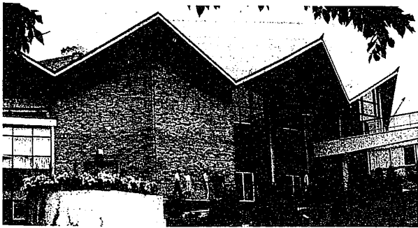
The concrete and glass home of Stratford Shakespearean Festival has become a familiar sight to millions of theater lovers.