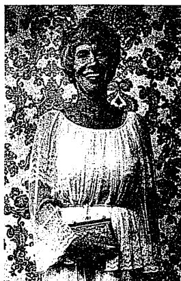
Mother of the bride can now wear a contemporary style like this lacy blouse with peasant neck.