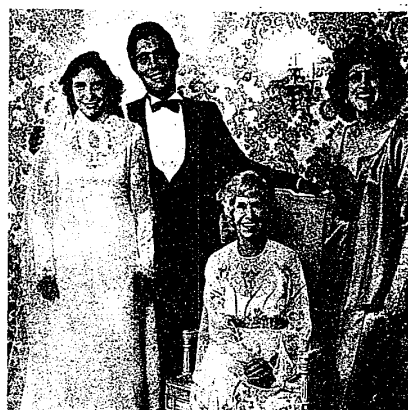
Family portraits in the wedding album will reflect each individual's style preference.