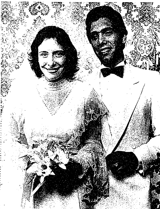
Elegance returns in wedding attire.