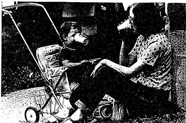
Time for a break

Bus routes for the school year will be posted in the Observer on Aug. 30 and also during the first week of September.