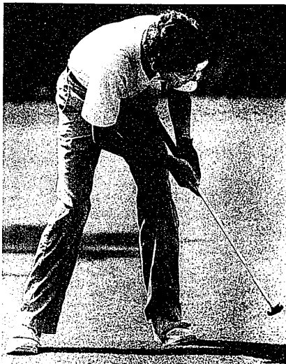
. . . taps it gently towards the cup . . .