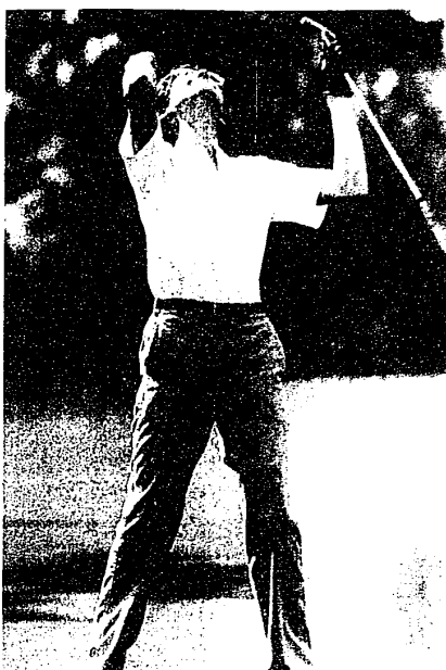
but is anguished with his bad luck.