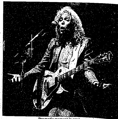
Dramatic moment in song.