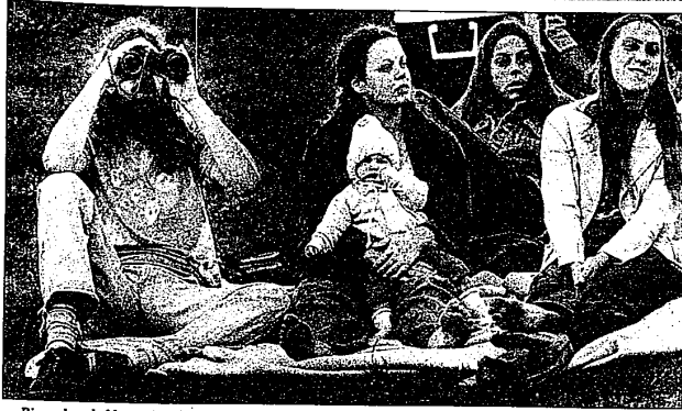
Binoculars held one fan's focus on the activity at Pine Knob. Bringing up baby starts with a musical education.