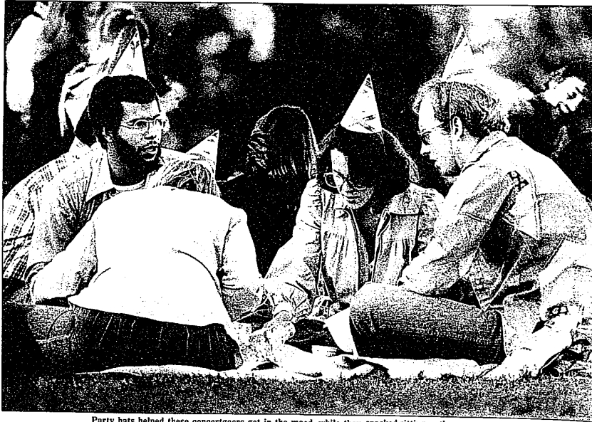
Party hats helped these concertgoers get in the mood, while they snacked sitting on the grass.