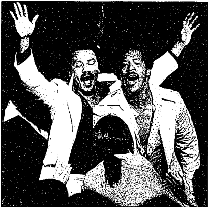
Sing out celebrates spirit of the concert.