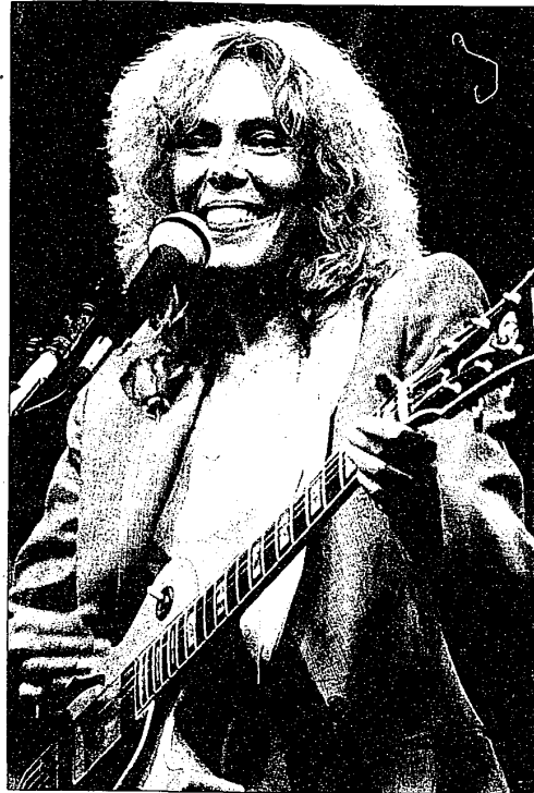
Joni Mitchell entertained her fans Saturday and Sunday at Pine Knob Music Theatre in Clarkston.

Renaissance Live, which debuted last summer, promises the Salsoul Orchestra and Michael Franks for the final two concerts of the 1979 summer season.