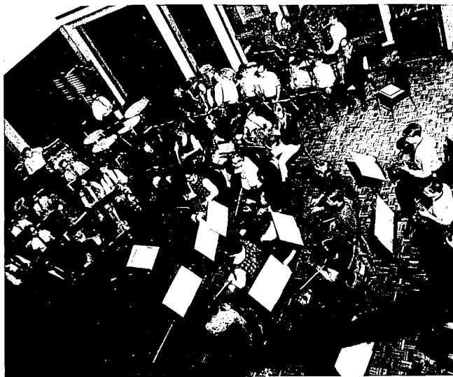
FROM ABOVE -- A bird's eye view of the Farmington Community Concert Band rehearsing at Oakland Community College.