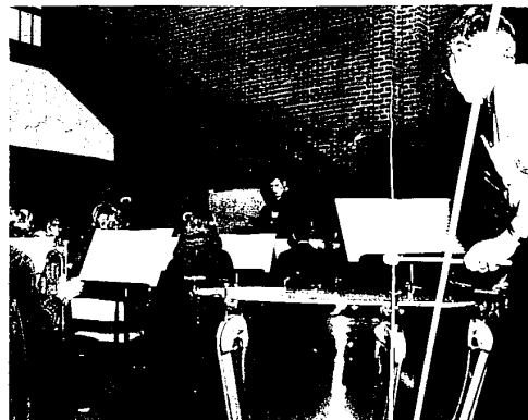
BOOM!!! -- The drum beats roll as the Farmington Community Concert Band rehearses.