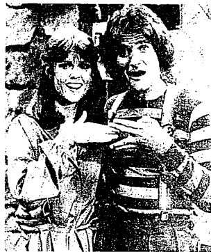
Robin Williams, star of "Mork and Mindy" (shown with co-star Pam Dawber) has been nominated for an Emmy as comedy lead.

"Mork and Mindy" the smash hit comedy series has moved to a new time, 8-8:30 p.m. Sundays for the fall season, and will be seen Sept. 9 following "Out of the Blue" and before the Emmys.