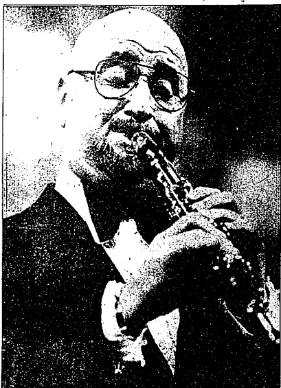
Pete Fountain and his Dixieland clarinet sounds will be heard from Wolf Trap.

LIVONIA • 15700 Middlebelt Road • PHONE 422-8770 UTICA • 50170 Van Dyke • PHONE 739-6100 SOUTHFIELD • 15600 W. 12 Mile Road • PHONE 557-1800