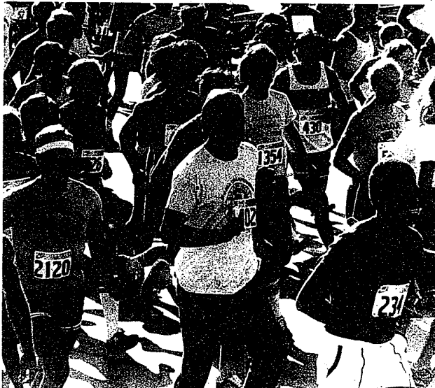
Area runners came from all over the state, as more than 1,600 athletes participated in Sunday's "Run for the Hills of Bloomfield" race. Proceeds from the race were donated to the Spaulding for Children fund.