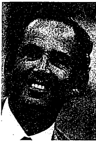
GOV. WILLIAM MILLIKEN "No contact"