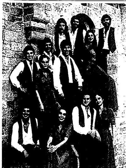
1979 Israeli Chassidic Festival features top Israeli stars.