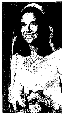
The couple received guests in Carriage House, and will make their home in Livonia.

The groom is a business administration graduate of Mercy College in Detroit. He studied law at Oxford University and was awarded his JD degree from Detroit College of Law. He is employed by Compuware, Inc.