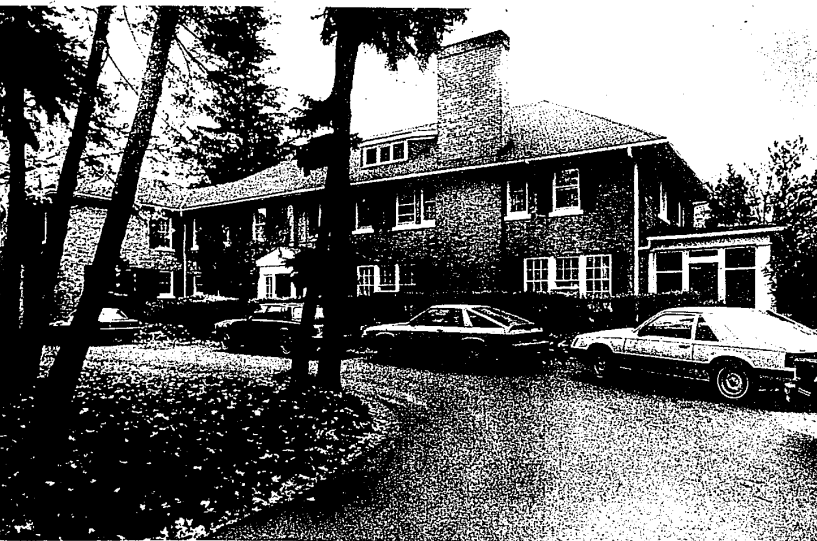
Every foot of available space is used in the building on Farmington Road, north of Ten Mile Road, with classes and special events listed on new brochures that are mailed out four times a year. Staff members