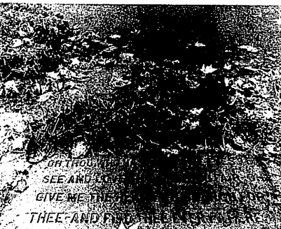
The inscription in the walk that overlooks the center's natural amphitheater reads: "Oh Thou who has given me eyes to see and love this sight so fair, oh give me the heart to search for Thee, and find thee everywhere."