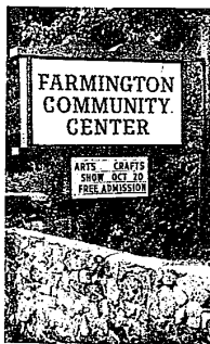
The sign that now stands at the center's entrance, announcing coming events, was a gift from Farmington Area Jaycees.

She described her past 10 years as "an education." Still, she looks ahead with enthusiasm in planning for more growth in the areas of special events, trips and classes for the coming winter's session.