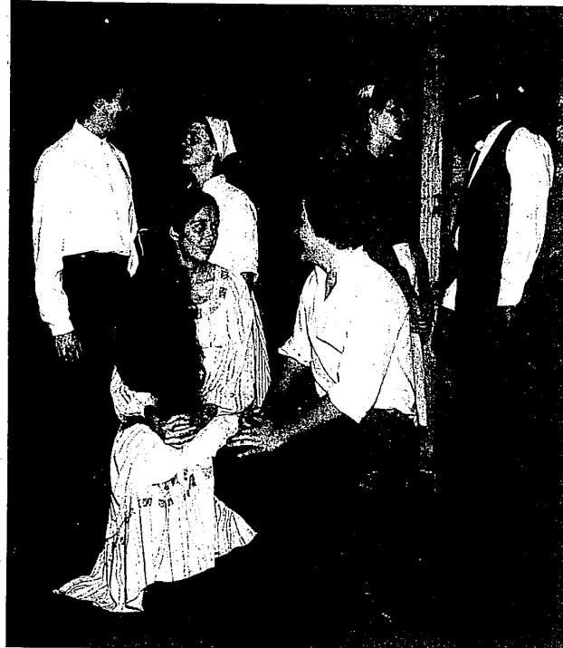
Avon Players are now performing "Fiddler on the Roof." Shows will be held at 8:30 p.m. Thursdays, Fridays and Saturdays and 7:30 p.m. Sunday.

The theater is at 1185 Washington Rd. in Avon Township.