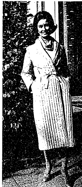
Ultra-Cashmere, here shown in a coat from Chudik's of Birmingham, is a fabulous fake with all the lux properties of cashmere and more. At less than half the price, it will last much longer.