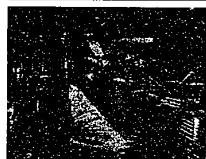
Separate men's exercise area