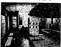
Separate locker room facilities complete with steam, sauna and sun rooms