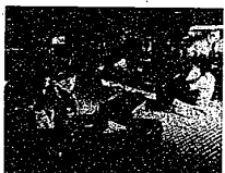
Luxurious lounge area