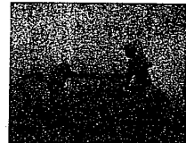
6 regulation racquetball/handball courts