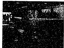
Juice bar and Pro Shop