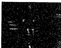
1/16 mile banked, indoor jogging track