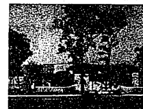
A total fitness center for men and women