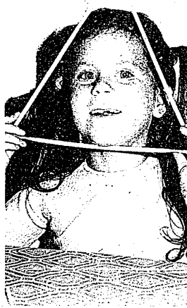
All she needed were straws and paperclips.

Not all children are collectors, but if you've got one, you'll know it.