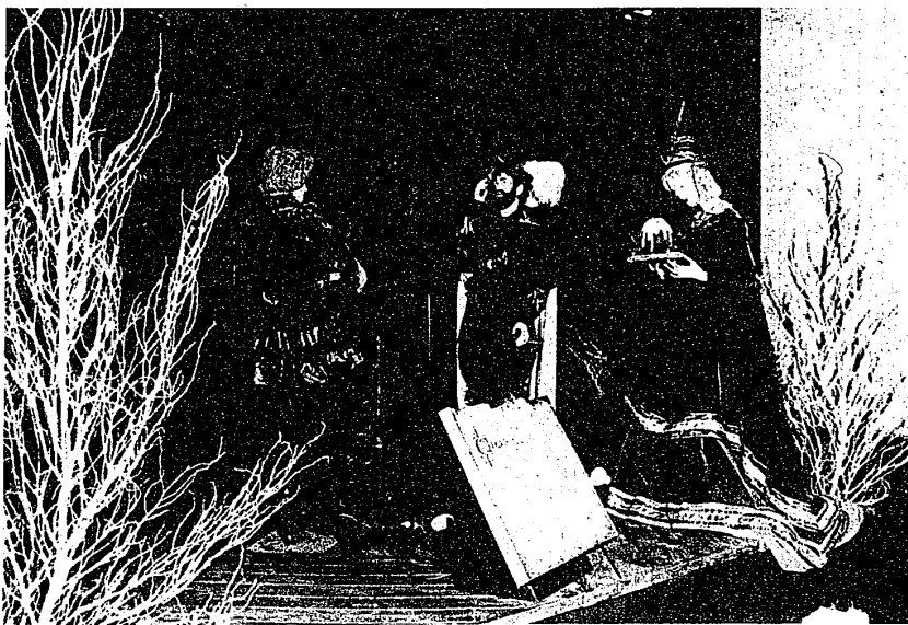
Life-size decorations fill the Detroit Plaza Hotel to express Christmas celebrations in other countries.