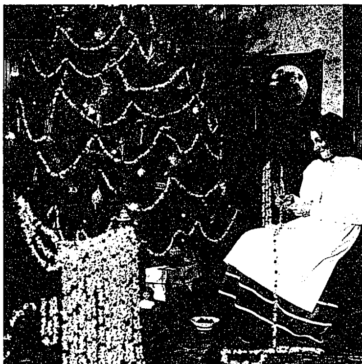
Decorating of another kind is exemplified in this photo of a holiday maker stringing popcorn and cranberries.